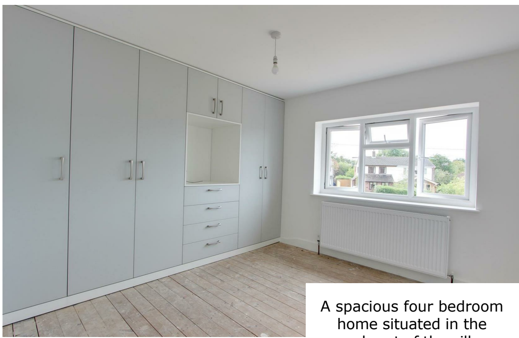
A spacious four bedroom home situated in the very heart of the village and NO ONWARD CHAIN.